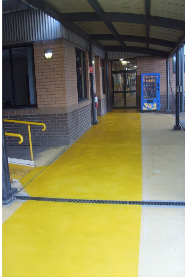
Above and Below