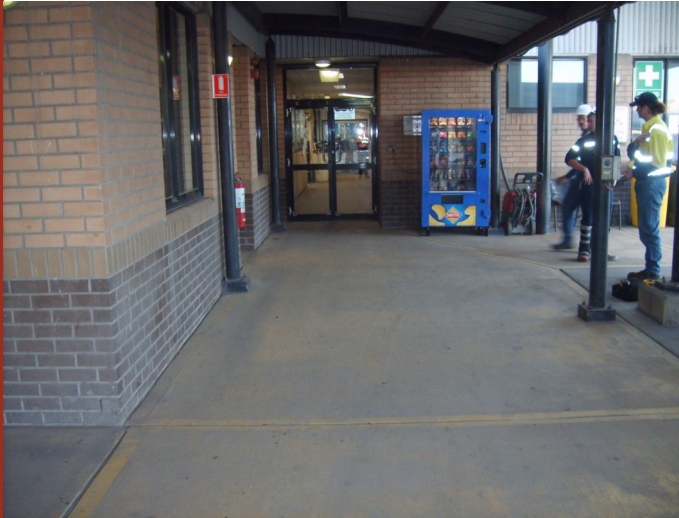
2. Walkway after hot water pressure cleaning