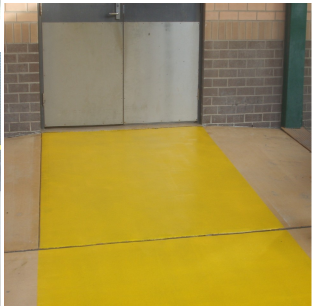
The completed walkway